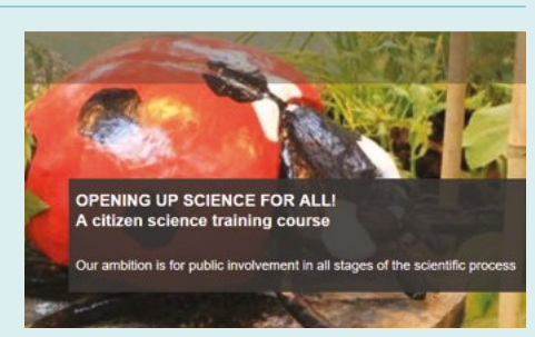
A free online introductory course about citizen science

Scoping a national community of practice (CoP) for public engagement with environmental research, working to address barriers to participation for scientists and publics. Exemplifying opening up environmental science through four local CoPs, open access citizen science training and our blog. Supporting collective learning, capacity-building initiatives, and shared resources.