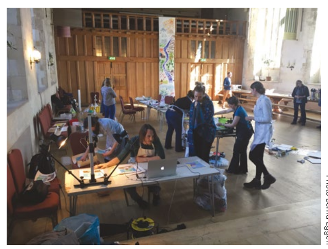
Getting creative at the Climate Stories workshop