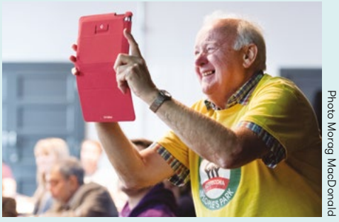
Delegate at the Engaging Environments Symposium

agendas. Equally, if not more important, were the partners from outside the research sector, from local groups for whom environmental science resonates. to national community networks or engagement specialists. Strengthening these networks and building trust and common purpose between them helps the work to send down deep roots and to be sustained.