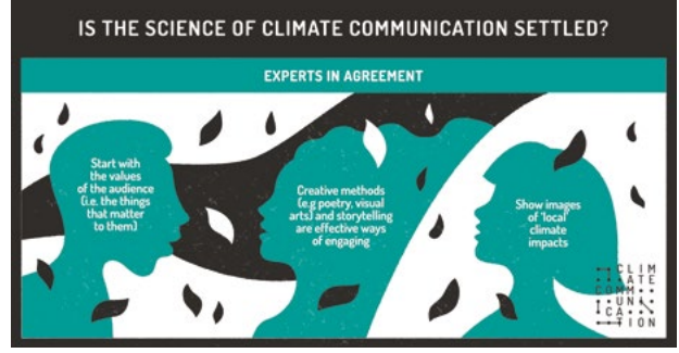
Lessons learned from The Climate Communication Project

engagement and how evidence is being used, and an expert elicitation workshop dug deeper. For example, experts agreed robust scientific evidence should be at the heart of climate communication, but that doesn't mean scientists can't advocate for policies or use evocative communication methods.