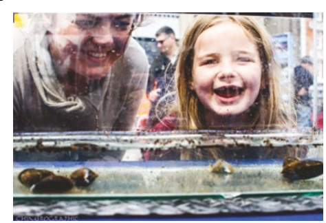
Future of our Seas, Plymouth event