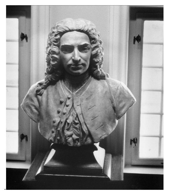
Photo of Linnaeus at Lund